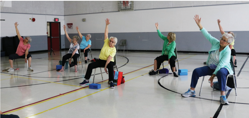
DCC's chair-based programs are a great option for those dealing with mobility issues.